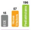
Providers trained in Developmental Screening (2010-11).

Over 25% of children 0-5 in Alameda County have a healthcare provider who is trained in developmental screening by First 5 Alameda County.